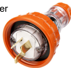
20 Amp plug with collar